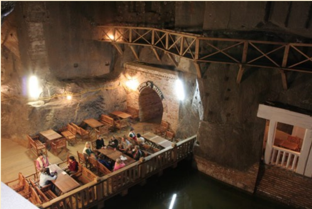
Treatment stays in the Wessel Lake Chamber from 1997.

We are convinced that there, you will obtain all the necessary information, and will find a convenient time to use our rehabilitation and treatment or our one-day programmes directed to those who want to live an exciting adventure while taking care of their own health and that of those close to them.